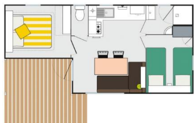
Surface : 25 sqm Year : 2024 model

Price / week (Saturday to Saturday) Arrival at 4pm until 7pm Departure before 11am