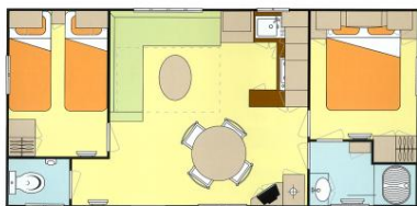
Surface : 27 to 30 sqm Year : less than 13 years or more than 16 years

Price / week (Saturday to Saturday) Arrival at 4pm until 7pm Departure before 11am