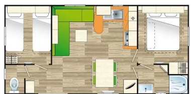
Surface : 27 to 30 sqm Year : less than 13 years or more than 16 years

Price / week (Saturday to Saturday) Arrival at 4pm until 7pm Departure before 11am